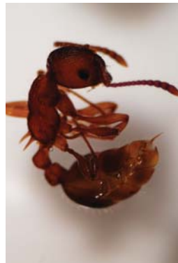
Above: Adult European fire ants on branch. Left: Adult ant. Below: Adults tending larvae and pupae in nest.