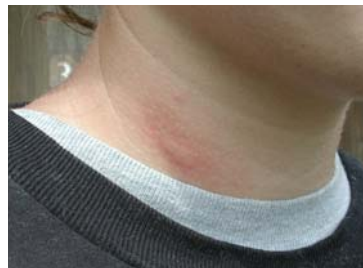
Left: European fire ant stings usually result in inflamed red areas from one to four inches in diameter.

Mating flights and colony founding by new winged queens, common in other ant species, does not appear to be a frequent mechanism of spread for these ants in their invasive range.