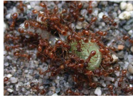
Right: European fire ants mobbing a caterpillar.

Contact the University of Maine Cooperative Extension's Pest Management Office for ant control tactics (telephone 207-581-3880; Web site www.umext.maine.edu/topics/pest.htm ).